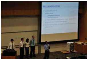
Figure 1. Sample screen shot of student group presentation.

Although women are well represented among the total undergraduate population at the University of Michigan, female students are outnumbered by male students in the College of Engineering. In 2009 and 2010, the incoming class in engineering was 23% female, consistent with national trends and reflective of gender stereotypes depicting engineering as a "male" domain. Because there are fewer female than male engineering students, the composition of small groups of students, including those assigned to complete class projects, is likely to be skewed in favor of men. In this study, we draw on research findings from psychology on the influence of gender stereotypes and skewed gender compositions on women working in male-dominated fields as well as research on self-efficacy and active participation to investigate the effect of skewed gender composition in small class project groups. We address the question of whether being in the gender minority has a detrimental effect on active participation in group project teams for female engineering students.